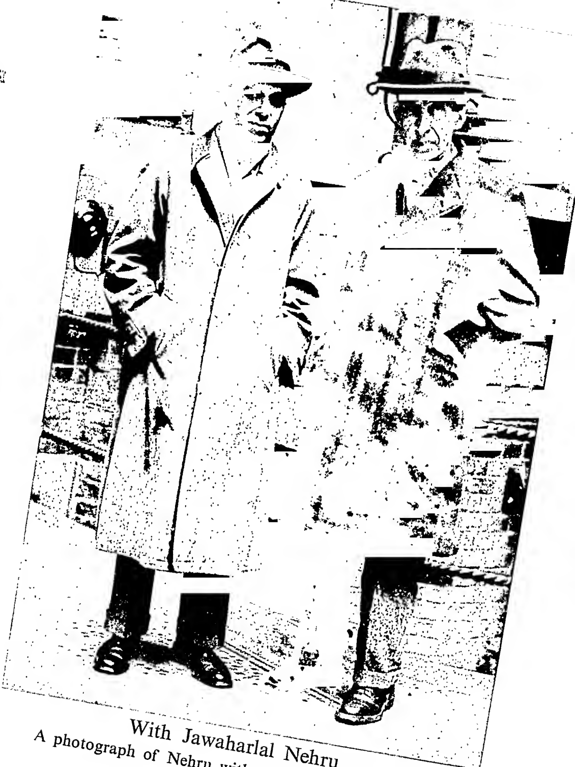
With Jawaharlal Nehru A photograph of Nehru with Leonard Woolf taken in London, 1936.